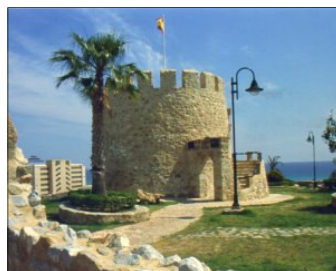
One of Torrevieja's restored towers

Due to tourism the local economy has expanded