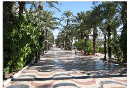
Alicante's famously curly Esplanada

THE Alicante International group is the oldest meeting on the Costa Blanca. Originally started in October 1978, by a Belgian, a Spaniard and an American the meeting, like many across Europe, was initially translated into several different languages. The English-speaking meeting continues to this day on Saturdays at 6pm near the harbour. Before the meeting it is a treat to sit on the well-known, busy Esplanada drinking an 'horchata' or having a refreshing 'blanco y negro' and watch as the world goes by.