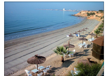
Punta Prima Beach, Torrevieja

Flora and fauna around Torrevieja's two enormous salt lakes is unusual and the lakes themselves can change