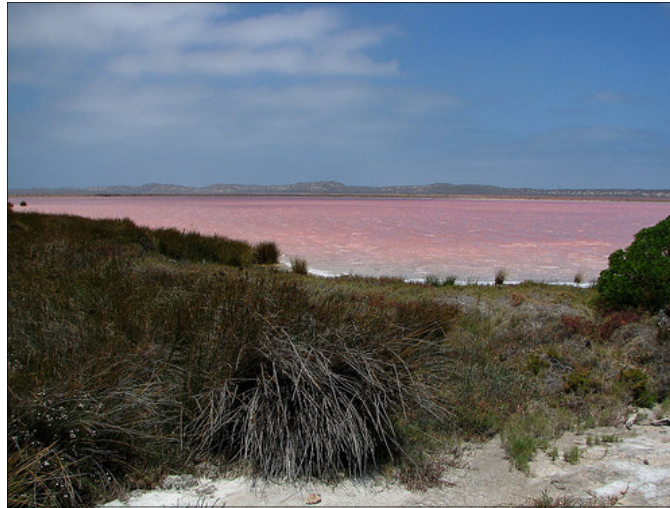
Salt lakes change hue and colour at different times of the day & year. Wonderful for bathing, relaxing (rubber sandals essential) & healing.

every August for choral groups to sing their Habaneras .