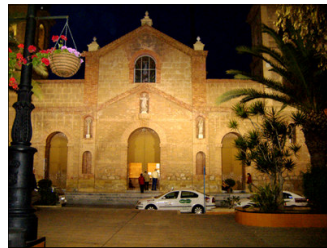
Torrevieja's main church

every August for choral groups to sing their Habaneras .