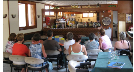
3.30pm: Rocajuna Function Rm, (Women's Meeting) Los Altos, Urb. Las Barcas, (just before Punta Prima roundabout on the N332), Torrevieja

IT may be frowned upon in the UK; perhaps prohibited in the US and unheard of in other parts of Europe but in Spain just about anything goes. A group of Torrevieja's women hold an AA meeting every Tuesday in a well-stocked pub. Although they don't obviously face the bar during the meeting, it's a hell of a venue!