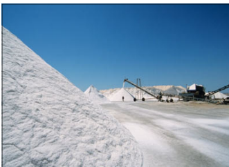
Salt — main industry for centuries

Salt mining and fishing have always been Torrevieja's lifeline, until the