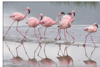
Flamingoes migrate to salt lakes

In 2004, 7,180 Brits were counted as residing in Torrevieja, the largest population of overseas